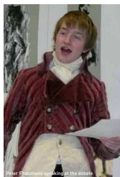
Peter Fitzsimons speaking at the debate