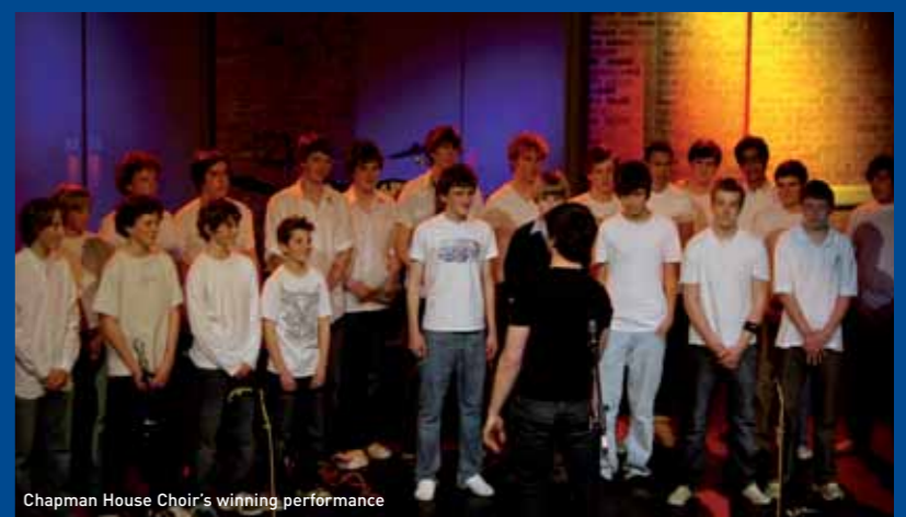
Chapman House Choir's winning performance

Chapman secured a well-earned victory overall, a rather historic win for a day house!