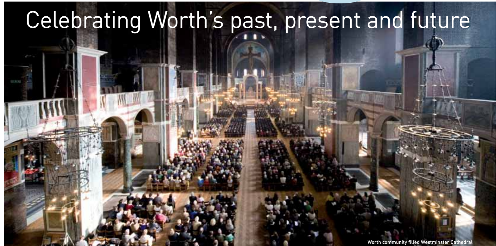
Worth community filled Westminster Cathedral

Anyone connected with Worth cannot fail to have noticed, and hopefully been involved in, the celebratory events that have been taking place since September to mark Worth Abbey's 75th anniversary. The year has been marked with special church services, a walk, two concerts, sports matches, a musical evening and a Passion Play, not to mention the forthcoming ball and conference.