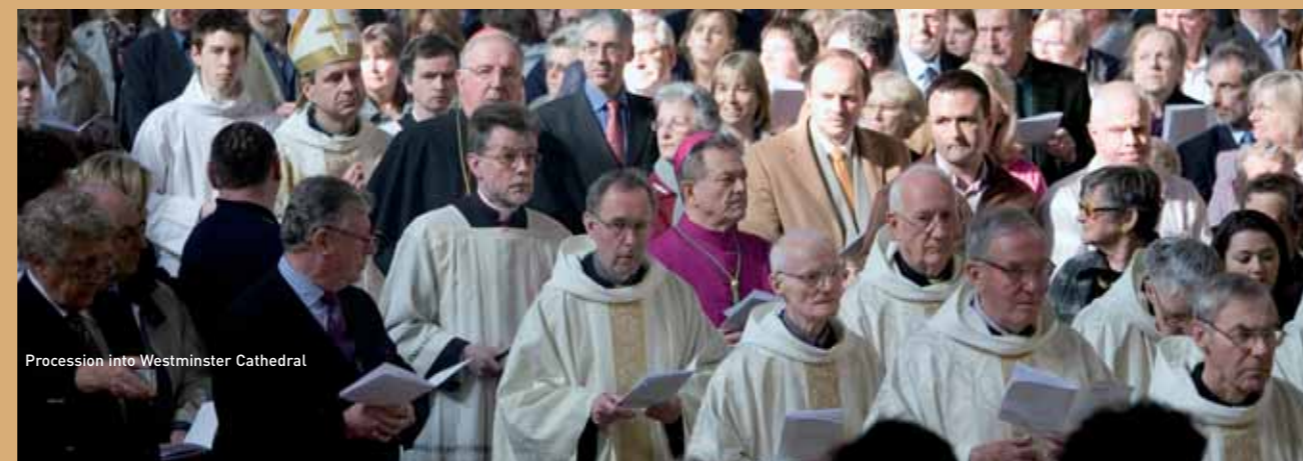
Procession into Westminster Cathedral