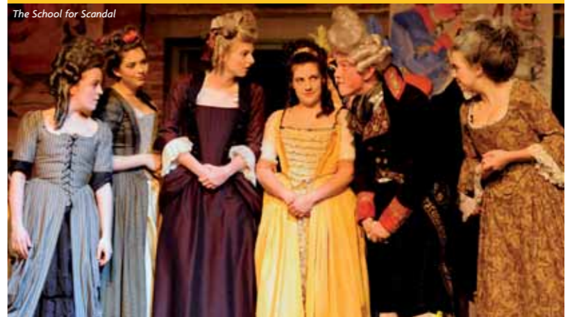
The School for Scandal