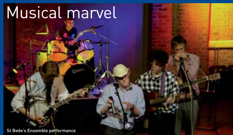
St Bede's Ensemble performance